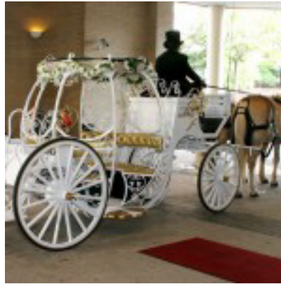
Christmas Carriage Rides

Friends Uniting Nokesville P.O. Box 461 Nokesville, Virginia 20182