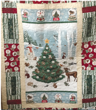
Christmas Quilt 2018